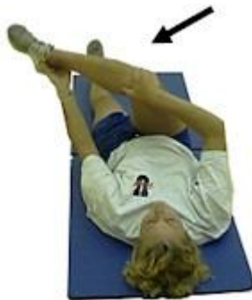
Figure Four (outer hip)