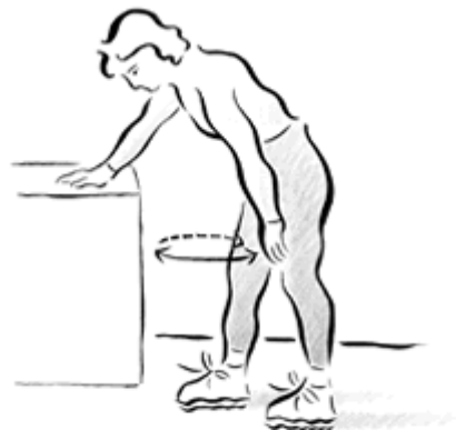
Figure 2. Pendulum exercise. Stand supporting yourself on a table with your good hand. Let your other arm hang down and swing it backwards and forwards and in a circular motion.

You should aim for a balance between rest and activity to prevent the shoulder from stiffening. One good exercise for all shoulder problems is called a pendulum exercise (see Figure 2). Stand with your good hand resting on a table. Let your other arm hang down and try to swing it gently backwards and forwards and in a circular motion. Another good exercise is to use your good arm to help lift up your painful arm.